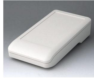
A9007117 DATEC-COMPACT L ASA+PC (UL 94 V-0) off-white RAL 9002 206x110x47mm IP 41