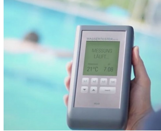
Electronic pool tester