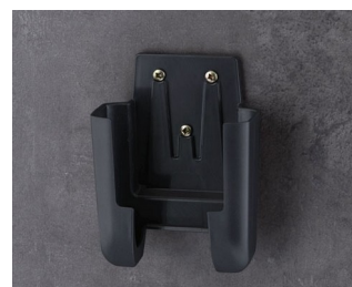
A9106628 Holder M ASA+PC (UL 94 V-0) lava