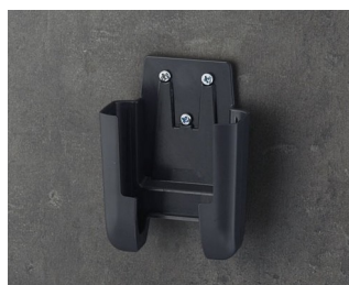
A9105628 Holder S ASA+PC (UL 94 V-0) lava