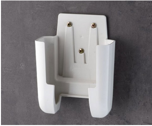
A9107627 Holder L ASA+PC (UL 94 V-0) off-white RAL 9002