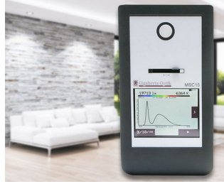
Spectral light meter