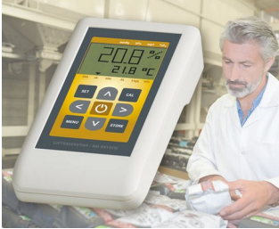
Atmospheric oxygen measuring unit

移动式数据采集。测量和控制技术。自动化技术。医疗和实验室技术。环保技术。户外应用。 Smart Factory。 Industry 4.0。