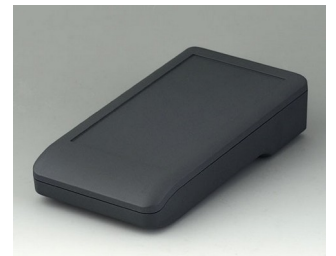
A9006118 DATEC-COMPACT M ASA+PC (UL 94 V-0) lava 172x92x39mm IP 41