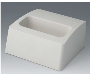
A9107507 Station L ASA+PC (UL 94 V-0) off-white RAL 9002