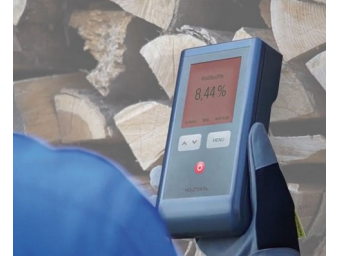
Wood moisture measuring device