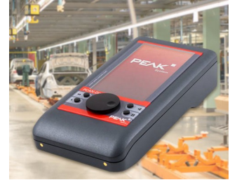
Mobile diagnostic device for CAN and CAN FD buses