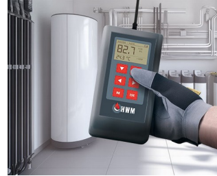
Measuring device for heating water