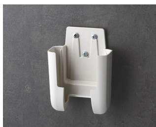
A9105627 Holder S ASA+PC (UL 94 V-0) off-white RAL 9002