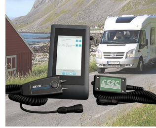
System for leak detection in leisure vehicles