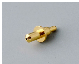
A9193031 Spring contact gold-plated