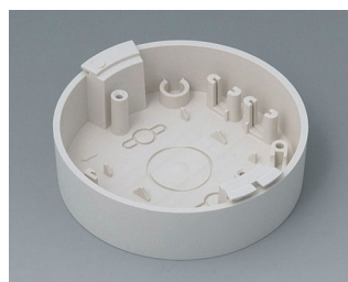
B5011117 Base ABS (UL 94 HB) off-white RAL 9002