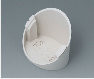
B5011317 Base 55° ABS (UL 94 HB) off-white RAL 9002