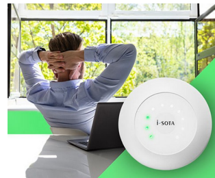
CO2 sensor traffic light