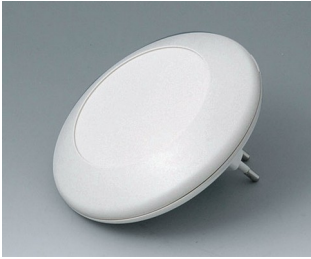
B5011227 ART-CASE R110 F PC+ABS (UL 94 V-0) off-white RAL 9002 ø110x38mm IP 40