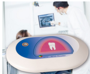
RFID Reader for the CTV system