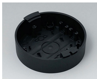
B5011119 Base ABS (UL 94 HB) black RAL 9005