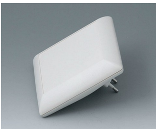
B5013227 ART-CASE S110 F PC+ABS (UL 94 V-0) off-white RAL 9002 110x110x38mm IP 40