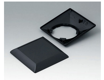
B5012209 Bottom and top part S110 F ABS (UL 94 HB) black RAL 9005 110x110x38mm