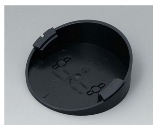
B5011219 Base 30° ABS (UL 94 HB) black RAL 9005