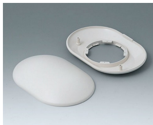
B5015107 Bottom and top part O160 H ABS (UL 94 HB) off-white RAL 9002 160x110x38mm