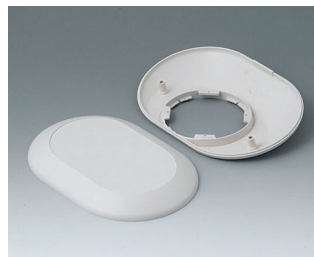
B5015207 Bottom and top part O160 F ABS (UL 94 HB) off-white RAL 9002 160x110x38mm