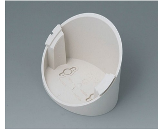
B5011317 Base 55° ABS (UL 94 HB) off-white RAL 9002