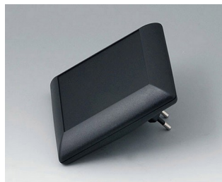
B5013229 ART-CASE S110 F PC+ABS (UL 94 V-0) black RAL 9005 110x110x38mm IP 40