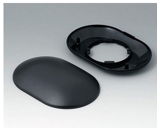
B5015109 Bottom and top part O160 H ABS (UL 94 HB) black RAL 9005 160x110x38mm