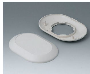
B5015007 Bottom and top part O160 F ABS (UL 94 HB) off-white RAL 9002 160x110x30mm