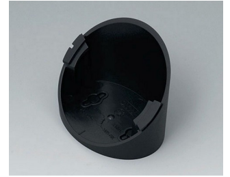
B5011319 Base 55° ABS (UL 94 HB) black RAL 9005