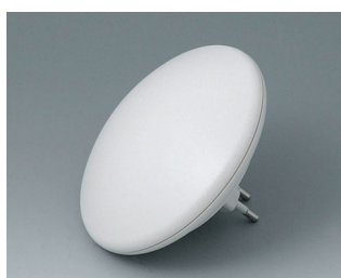
B5011127 ART-CASE R110 H PC+ABS (UL 94 V-0) off-white RAL 9002 ø110x38mm IP 40