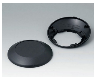
B5010209 Bottom and top part R110 F ABS (UL 94 HB) black RAL 9005 ø110x38mm