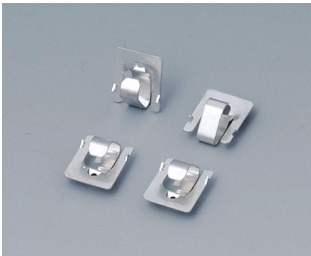
A9166001 Set of battery clips, 2 x AAA Steel tin-plated