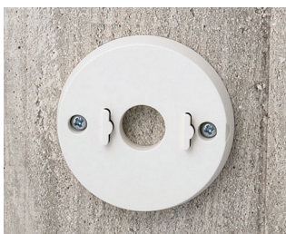
B5111307 Wall mounting set ABS (UL 94 HB) off-white RAL 9002