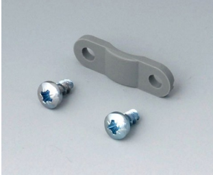
A9199005 Strain relief PA 6 volcano