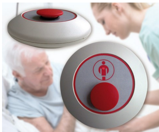
Radio paging mushroom-type button