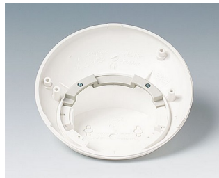
B5111707 Anti-rotation device ABS (UL 94 HB) off-white RAL 9002