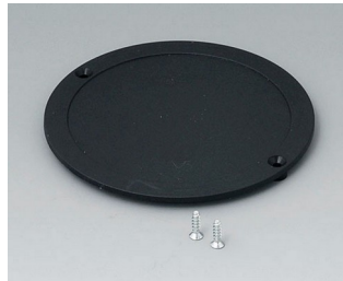
B5011859 Battery compartment lid ABS (UL 94 HB) black RAL 9005