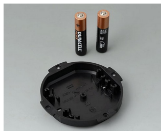
B5111109 Battery compartment, 2 x AAA ABS (UL 94 HB) black RAL 9005