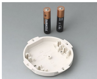
B5111107 Battery compartment, 2 x AAA ABS (UL 94 HB) off-white RAL 9002