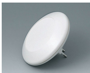
B5011027 ART-CASE R110 F PC+ABS (UL 94 V-0) off-white RAL 9002 ø110x30mm IP 40