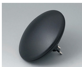
B5011129 ART-CASE R110 H PC+ABS (UL 94 V-0) black RAL 9005 ø110x38mm IP 40