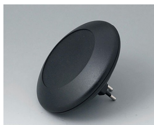
B5011029 ART-CASE R110 F PC+ABS (UL 94 V-0) black RAL 9005 ø110x30mm IP 40