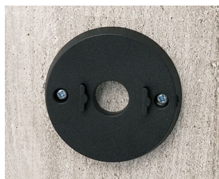
B5111309 Wall mounting set ABS (UL 94 HB) black RAL 9005