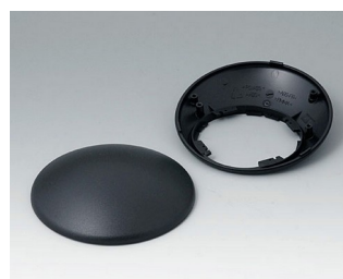
B5010309 Bottom and top part R110 H ABS (UL 94 HB) black RAL 9005 ø110x41mm