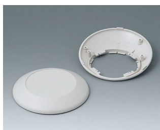
B5010207 Bottom and top part R110 F ABS (UL 94 HB) off-white RAL 9002 ø110x38mm