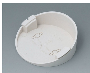
B5011217 Base 30° ABS (UL 94 HB) off-white RAL 9002