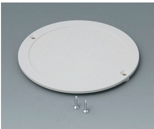
B5011857 Battery compartment lid ABS (UL 94 HB) off-white RAL 9002