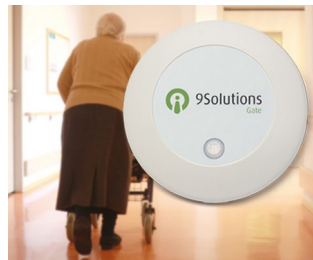
Access management in care facilities