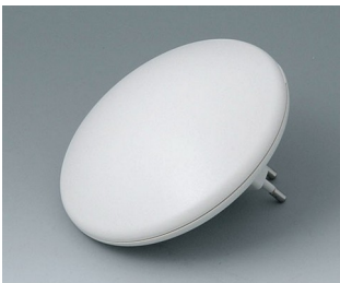
B5011327 ART-CASE R110 H PC+ABS (UL 94 V-0) off-white RAL 9002 ø110x41mm IP 40