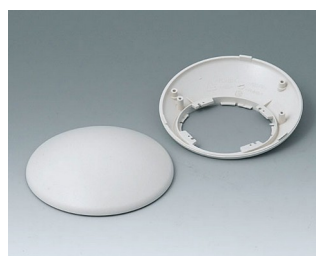
B5010307 Bottom and top part R110 H ABS (UL 94 HB) off-white RAL 9002 ø110x41mm