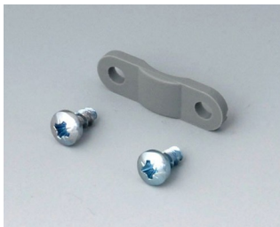
A9199005 Strain relief PA 6 volcano