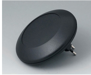
B5011229 ART-CASE R110 F PC+ABS (UL 94 V-0) black RAL 9005 ø110x38mm IP 40