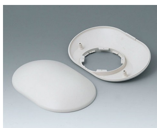
B5015307 Bottom and top part O160 H ABS (UL 94 HB) off-white RAL 9002 160x110x41mm