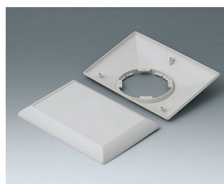
B5017207 Bottom and top part E160 F ABS (UL 94 HB) off-white RAL 9002 160x110x38mm