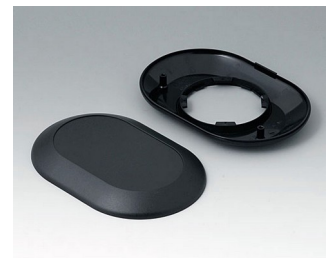
B5015009 Bottom and top part O160 F ABS (UL 94 HB) black RAL 9005 160x110x30mm