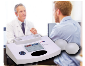
Multiple analytical resonance system