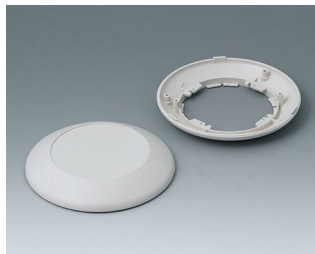
B5010007 Bottom and top part R110 F ABS (UL 94 HB) off-white RAL 9002 ø110x30mm