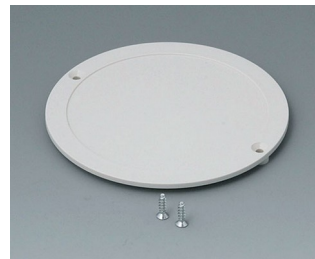
B5011847 Lid ABS (UL 94 HB) off-white RAL 9002