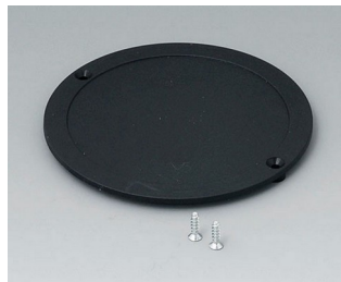
B5011859 Battery compartment lid ABS (UL 94 HB) black RAL 9005