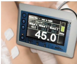
3D angle measurement of articulation systems on a gravity basis

专门为室内的电气和电子应用设计，例如，建筑行业 and 家用技术的传输和接收单元，医疗技术，保健行业，计算机外围设备，网络技术，安全技术等