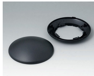
B5010109 Bottom and top part R110 H ABS (UL 94 HB) black RAL 9005 ø110x38mm