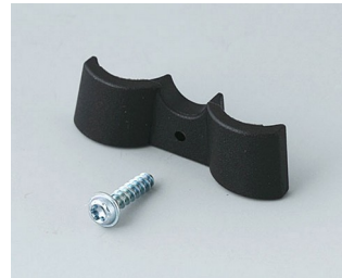
A9166003 Battery holder, 2 x AAA PA 6 (UL 94 HB) black RAL 9005