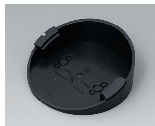
B5011219 Base 30° ABS (UL 94 HB) black RAL 9005