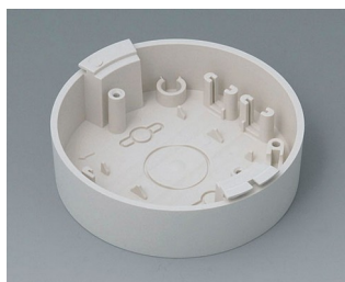
B5011117 Base ABS (UL 94 HB) off-white RAL 9002