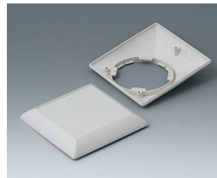
B5012207 Bottom and top part S110F ABS (UL 94 HB) off-white RAL 9002 110x110x38mm