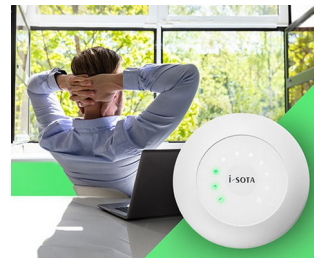
CO2 sensor traffic light