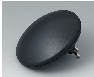
B5011329 ART-CASE R110 H PC+ABS (UL 94 V-0) black RAL 9005 ø110x41mm IP 40