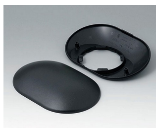
B5015309 Bottom and top part O160 H ABS (UL 94 HB) black RAL 9005 160x110x41mm