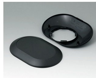
B5015209 Bottom and top part O160 F ABS (UL 94 HB) black RAL 9005 160x110x38mm