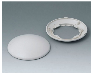
B5010107 Bottom and top part R110 H ABS (UL 94 HB) off-white RAL 9002 ø110x38mm