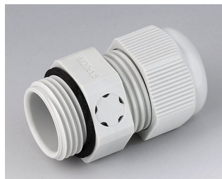
C2320917 Cable gland M20x1.5, pressure compensation PA 6 (UL 94 V-0) light grey RAL 7035 IP 68