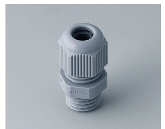
C2312418 Cable gland M12x1.5 PA 6 silver grey RAL 7001