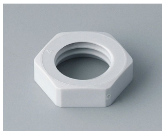
C2312117 Counternut M12x1.5 PA 6 light grey RAL 7035