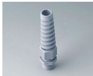
C2320528 Cable gland M20x1.5, bending protection PA 6 silver grey RAL 7001