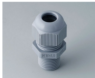
C2316618 Cable gland M16x1.5 PA 6 silver grey RAL 7001 IP 68