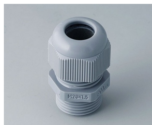
C2320418 Cable gland M20x1.5 PA 6 silver grey RAL 7001