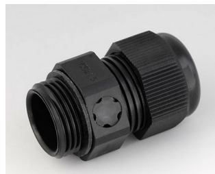
C2320919 Cable gland M20x1.5, pressure compensation PA 6 (UL 94 V-0) black RAL 9005 IP 68