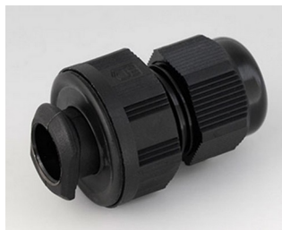
C2316719 Quick fix cable gland, M16 PA 6 black RAL 9005