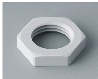
C2316117 Counternut M16x1.5 PA 6 light grey RAL 7035