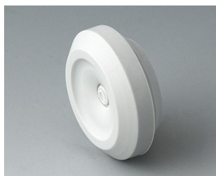
C2320147 Cable grommet TPE light grey RAL 7035