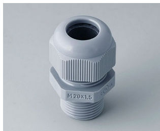
C2320428 Cable gland M20x1.5 PA 6 silver grey RAL 7001