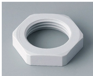
C2320117 Counternut M20x1.5 PA 6 light grey RAL 7035