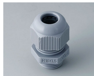
C2316418 Cable gland M16x1.5 PA 6 silver grey RAL 7001 IP 68