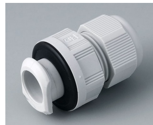
C2320717 Quick fix cable gland, M20 PA 6 light grey RAL 7035