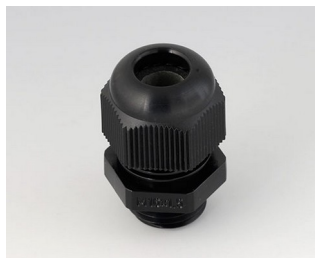
C2316419 Cable gland M16x1.5 PA 6 black RAL 9005 IP 68