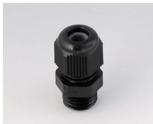
C2312419 Cable gland M12x1.5 PA 6 black RAL 9005 IP 68