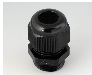
C2320419 Cable gland M20x1.5 PA 6 black RAL 9005