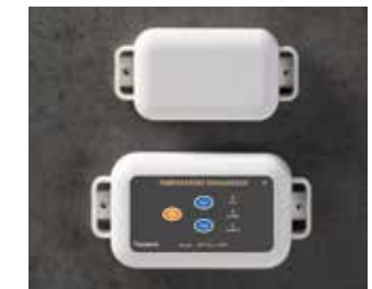
EASYTEC Robust enclosures with external flanges for quick wall mounting or attachment to pipes/rails.