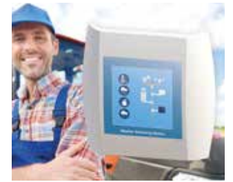
DIATEC Robust wall-mount enclosures, perfect for communications and networks. Low-profile design.