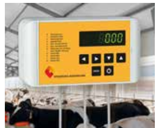
SMART-BOX IP 66 industrial electronic enclosures with hinged lid trims, hidden fixings and 'lid-closed' installation.