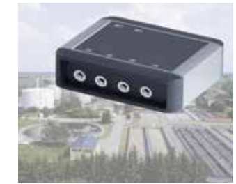
SMART-TERMINAL Aluminium profile housing with plastic cover caps. Plenty of space for interfaces and installations.