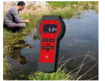
DATEC-CONTROL Handheld housing for large displays. Easy to grip for greater comfort. IP 65 (sizes XS, S)/IP 54 (sizes M, L).