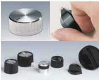
TUNING KNOBS 'CLASSIC'