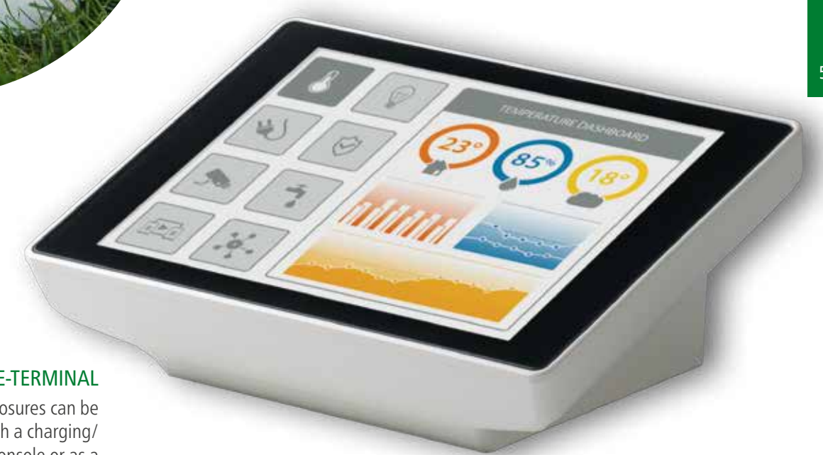
INTERFACE-TERMINAL These multifunctional enclosures can be used for mobile devices with a charging/docking station, as a console or as a wall-mounted housing. Available in three plan sizes and various heights.