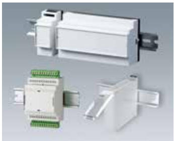
RAILTEC B / C