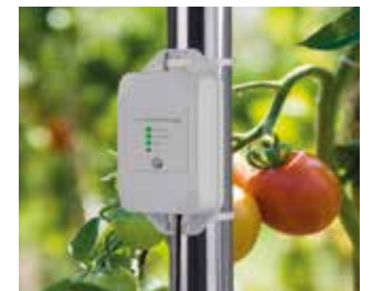
MINI-DATA-BOX Compact enclosures available with or without flanges. Ideal for a wide range of indoor/outdoor applications.