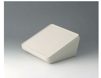
B4418107 PROTEC 180, Vers. I ASA+PC (UL 94 V-0) off-white RAL 9002 180x180x92mm IP 65 opt.