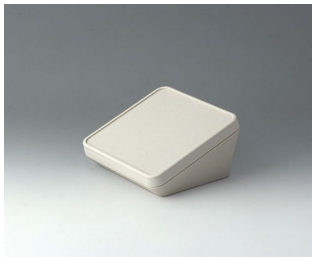
B4414107 PROTEC 140, Vers. I ASA+PC (UL 94 V-0) off-white RAL 9002 140x140x76mm IP 65 opt.