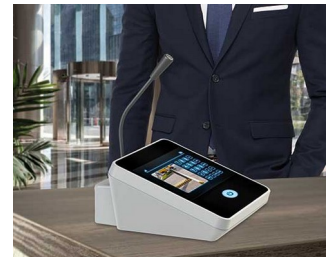
Table microphone / inter phone