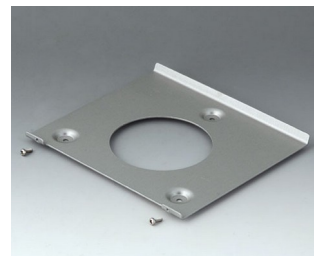
B4522101 Wall suspension element 220 Aluminium