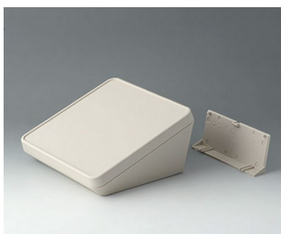
B4418207 PROTEC 180, Vers. II ASA+PC (UL 94 V-0) off-white RAL 9002 180x180x92mm IP 65 opt.