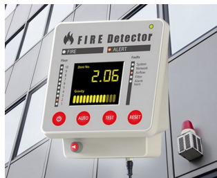
Terminal for fire alarm systems