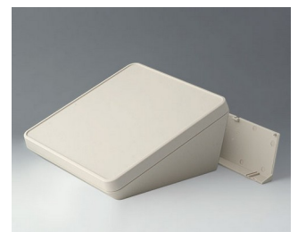
B4422207 PROTEC 220, Vers. II ASA+PC (UL 94 V-0) off-white RAL 9002 220x220x108mm IP 65 opt.