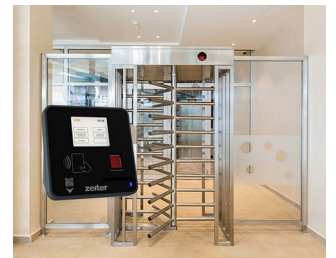
Terminal for access control