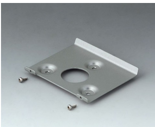
B4514101 Wall suspension element 140 Aluminium