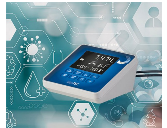
Laboratory measuring device