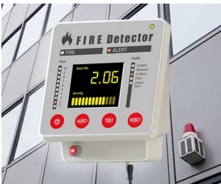
Terminal for fire alarm systems