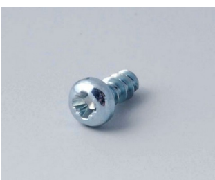
A0305031 Self-tapping screws 2.5 x 6 mm (PZ1)