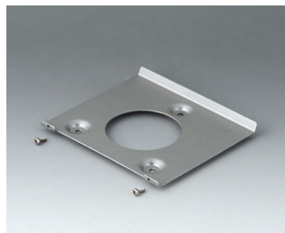
B4518101 Wall suspension element 180 Aluminium