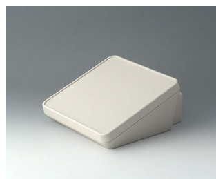
B4418307 PROTEC 180, Vers. III ASA+PC (UL 94 V-0) off-white RAL 9002 180x201x92mm IP 65 opt.