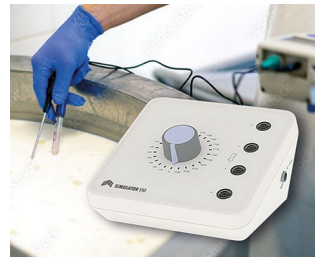
Simulator for testing measuring instruments