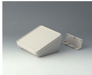
B4414207 PROTEC 140, Vers. II ASA+PC (UL 94 V-0) off-white RAL 9002 140x140x76mm IP 65 opt.