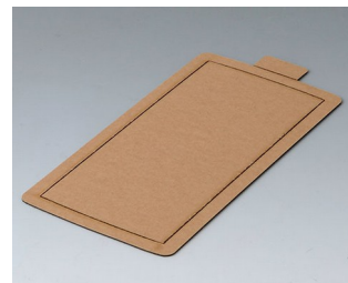
B5503300 Adhesive foil M