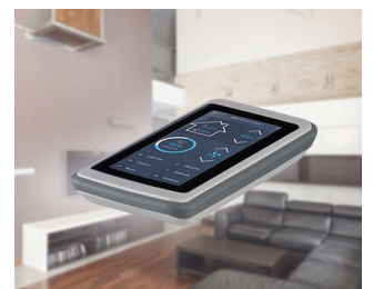
Smart Home Control