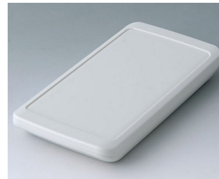
B5403207 SLIM-CASE M, Vers. II ASA+PC (UL 94 V-0) off-white RAL 9002 148x74x19mm IP 65 opt., IP 40