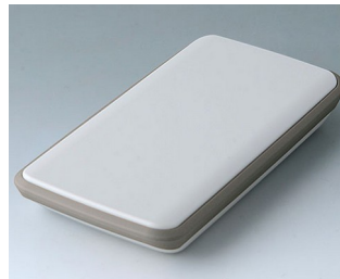
B5403117 SLIM-CASE M, Vers. IV ASA+PC (UL 94 V-0) off-white RAL 9002 148x74x22mm IP 54