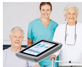
Sensor Checkup System / Monitoring