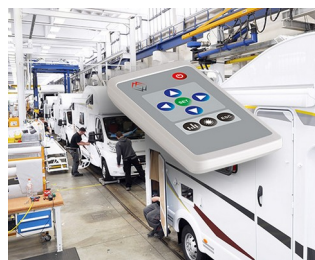
Remote control for interior design