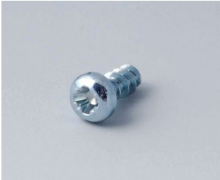
A0305031 Self-tapping screws 2.5 x 6 mm (PZ1)