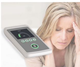
Biofeedback to reduce stress

Ideal for mobile electronics applications, indoors as well as outdoors. Measuring and control technology, wireless communication, IoT/IIoT, medical and laboratory technology, health care, office, safety engineering, environmental technology, etc.