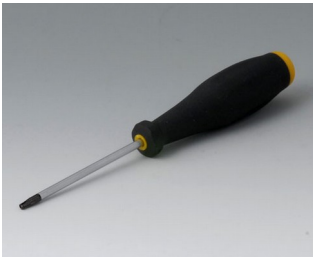
A0399T08 Torx T8 screwdriver

Subject to technical modification without notice. © by OKW Gehäusesysteme, Buchen/Germany.