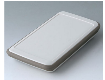
B5403217 SLIM-CASE M, Vers. V ASA+PC (UL 94 V-0) off-white RAL 9002 148x74x22mm IP 54