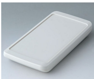
B5403307 SLIM-CASE M, Vers. III ASA+PC (UL 94 V-0) off-white RAL 9002 148x74x19mm IP 65 opt., IP 40