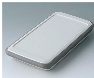
B5403317 SLIM-CASE M, Vers. VI ASA+PC (UL 94 V-0) off-white RAL 9002 148x74x22mm IP 54