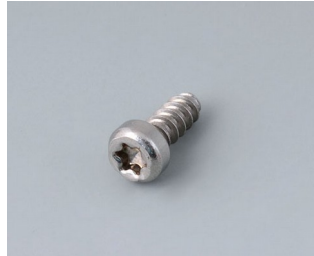
A0325060 Self-tapping screw 2.5 x 6 mm (T8) Stainless steel