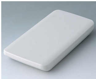
B5403107 SLIM-CASE M, Vers. I ASA+PC (UL 94 V-0) off-white RAL 9002 148x74x19mm IP 65 opt., IP 40