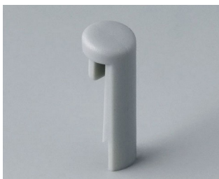
A1101007 Pin PA 6 (UL 94 HB) mineral