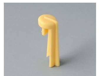
A1105004 Arrow PA 6 (UL 94 HB) beach