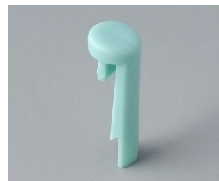
A1101005 Pin PA 6 (UL 94 HB) lagoon