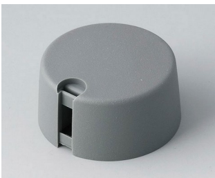
A1031648 TOP-KNOBS 31 PA 6 volcano 31x16mm