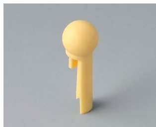
A1102004 Globe PA 6 (UL 94 HB) beach