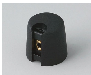
A1016049 TOP-KNOBS 16 PA 6 nero 16x16mm 4mm