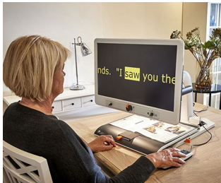
Control knobs for video magnifier

For rotary potentiometers with shaft ends corresponding to DIN 41591 or with flattened ends \varnothing 6/4.6 mm. Measuring and control technology, medical and wellness devices, laboratory equipment, heating and air conditioning, communication equipment, building management, etc.