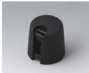
A1016649 TOP-KNOBS 16 PA 6 nero 16x16mm