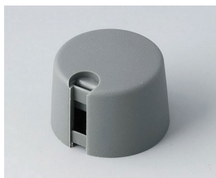
A1024068 TOP-KNOBS 24 PA 6 volcano 24x16mm 6mm