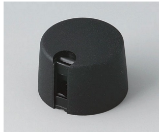
A1024649 TOP-KNOBS 24 PA 6 nero 24x16mm