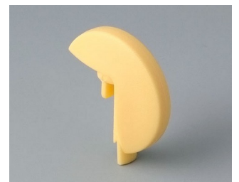
A1103004 Disk PA 6 (UL 94 HB) beach