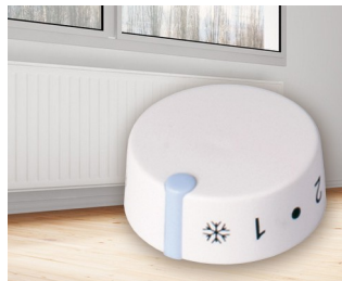
Integrated thermostat for electric storage heaters