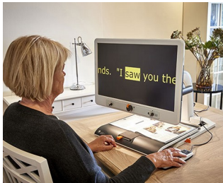
Control knobs for video magnifier

For rotary potentiometers with shaft ends corresponding to DIN 41591 or with flattened ends \varnothing 6/4.6 mm. Measuring and control technology, medical and wellness devices, laboratory equipment, heating and air conditioning, communication equipment, building management, etc.