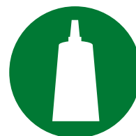
Installation / Assembly of accessories