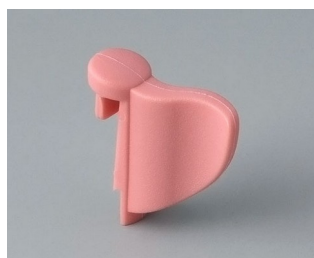
A1104003 Wing PA 6 (UL 94 HB) coral