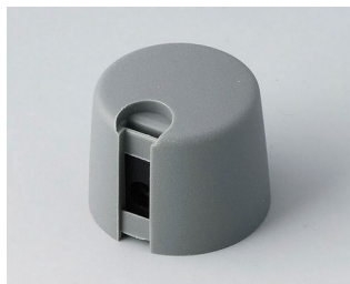
A1020648 TOP-KNOBS 20 PA 6 volcano 20x16mm