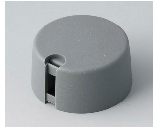
A1031048 TOP-KNOBS 31 PA 6 volcano 31x16mm 4mm