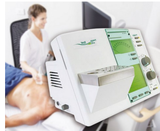
Operating element for a diagnostic device