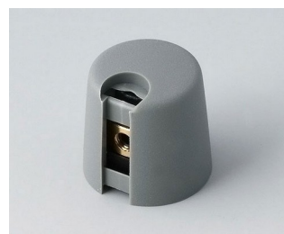
A1016068 TOP-KNOBS 16 PA 6 volcano 16x16mm 6mm