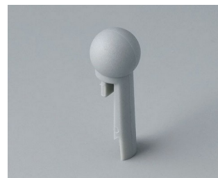
A1102007 Globe PA 6 (UL 94 HB) mineral