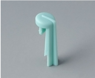
A1105005 Arrow PA 6 (UL 94 HB) lagoon