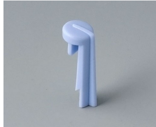
A1105006 Arrow PA 6 (UL 94 HB) sky