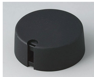
A1040049 TOP-KNOBS 40 PA 6 nero 40x16mm 4mm