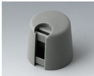
A1016648 TOP-KNOBS 16 PA 6 volcano 16x16mm