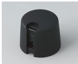
A1020649 TOP-KNOBS 20 PA 6 nero 20x16mm