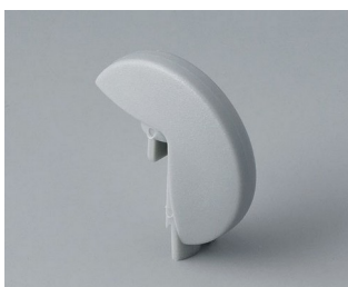
A1103007 Disk PA 6 (UL 94 HB) mineral