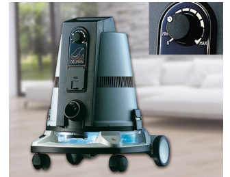
Operating element for a vacuum cleaner