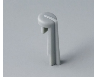
A1105007 Arrow PA 6 (UL 94 HB) mineral