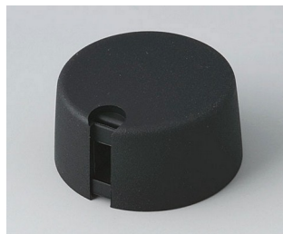
A1031649 TOP-KNOBS 31 PA 6 nero 31x16mm