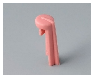
A1105003 Arrow PA 6 (UL 94 HB) coral