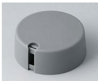
A1040068 TOP-KNOBS 40 PA 6 volcano 40x16mm 6mm