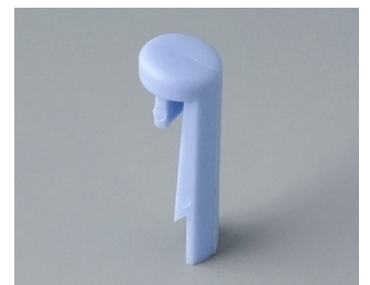
A1101006 Pin PA 6 (UL 94 HB) sky