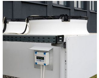
Heating/air conditioning/ventilation control