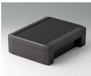
C8017221 SOLID-BOX 175 PC+ABS (UL 94 V-0) anthracite grey RAL 7016 225x175x70mm IP 66, IP 67, IK 08