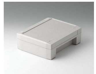
C8014182 SOLID-BOX 145 PC+ABS (UL 94 V-0) light grey RAL 7035 180x145x60mm IP 66, IP 67, IK 08