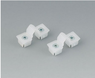
C2299031 Securing hinge for the cover PP natural-coloured