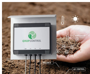
Smart Farming - system for long-term measurements