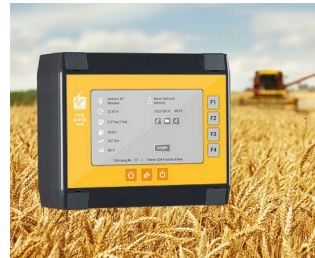
Data recording for harvesters