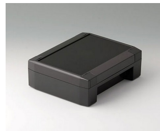
C8014181 SOLID-BOX 145 PC+ABS (UL 94 V-0) anthracite grey RAL 7016 180x145x60mm IP 66, IP 67, IK 08