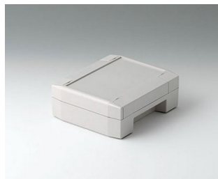
C8011132 SOLID-BOX 115 PC+ABS (UL 94 V-0) light grey RAL 7035 135x115x50mm IP 66, IP 67, IK 08