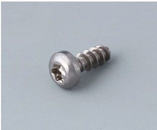
A0308132 Self-tapping screw 3 x 8 mm (T10) Stainless steel