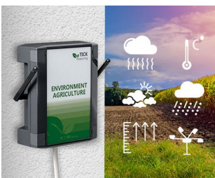
Weather station in agriculture