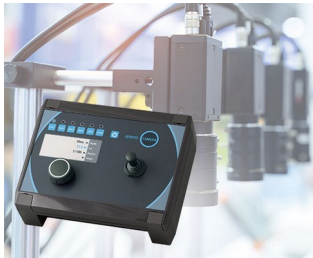
Camera control in production

Ideal for high-quality electronic and electrical equipment which is used indoors or in protected outdoor areas, e.g. plant and machine construction, heating, air conditioning and ventilation technology, IoT/IIoT, smart factory/Industry 4.0, gateways, data loggers, information and communications technology (ICT), electrical installations, measuring and control technology, agriculture, farming, sensor systems and safety engineering.