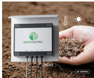
Smart Farming - system for long-term measurements