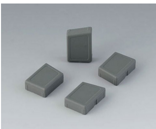
C8100188 Set of enclosure feet SEBS (TPE) volcano

Subject to technical modification without notice. © by OKW Gehäusesysteme, Buchen/Germany.