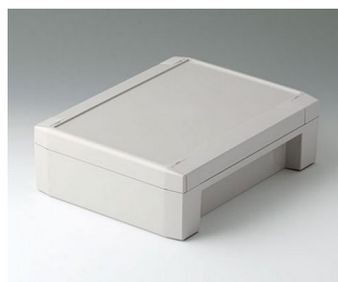
C8017222 SOLID-BOX 175 PC+ABS (UL 94 V-0) light grey RAL 7035 225x175x70mm IP 66, IP 67, IK 08