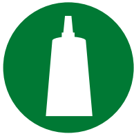
Installation / Assembly of accessories