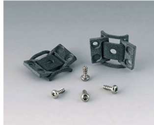
C8100360 Internal hinge set