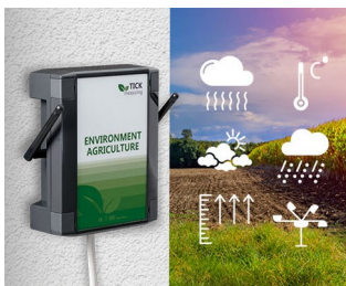
Weather station in agriculture