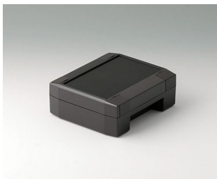
C8011131 SOLID-BOX 115 PC+ABS (UL 94 V-0) anthracite grey RAL 7016 135x115x50mm IP 66, IP 67, IK 08