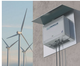
Controller wind turbines