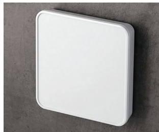
C6404107 SMART-PANEL S114 ASA+PC (UL 94 V-0) traffic white RAL 9016 114x114x21.3mm IP 40