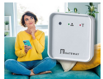
Smart home gateway