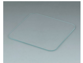
C6502013 Glass panel S84 Glass clear 78.75x78.75x1.6mm