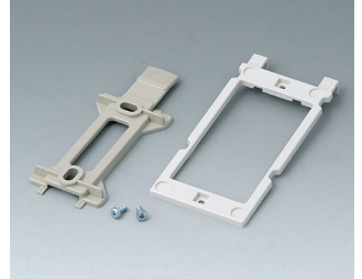
B1350048 Wall suspension elements ABS (UL 94 HB) pebble grey RAL 7032