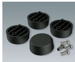
A9257409 Case feet, Vers. I ABS (UL 94 HB) black RAL 9005 ø30x12mm