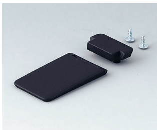
A9152059 Tilt foot bar ABS (UL 94 HB) black RAL 9005