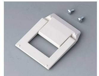
A9250817 Tilt foot bar ABS (UL 94 HB) off-white RAL 9002