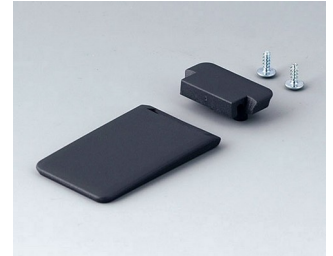
A9152058 Tilt foot bar ABS (UL 94 HB) lava