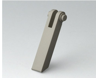
A0350008 Tilt foot ABS (UL 94 HB) pebble grey RAL 7032