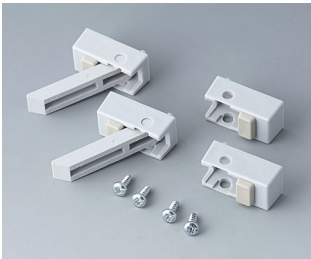
A9257205 Case feet, Vers. II ABS (UL 94 HB) light grey RAL 7035