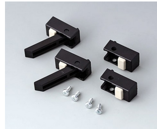
A9257209 Case feet, Vers. II ABS (UL 94 HB) black RAL 9005