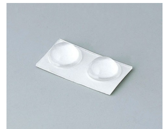
A9210290 Anti-slide feet 9.5 x 3.8 mm transparent