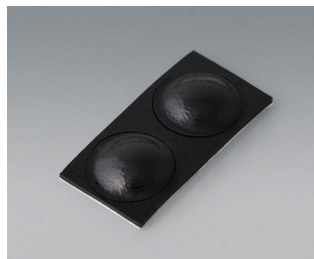
A9209229 Anti-slide feet 8.5 x 2.2 mm black