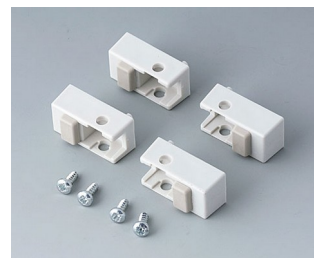
A9257107 Case feet, Vers. I ABS (UL 94 HB) off-white RAL 9002