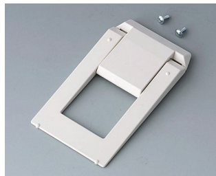
A9250807 Tilt foot bar ABS (UL 94 HB) off-white RAL 9002