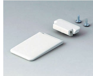
A9152057 Tilt foot bar ABS (UL 94 HB) off-white RAL 9002