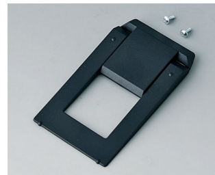
A9250809 Tilt foot bar ABS (UL 94 HB) black RAL 9005