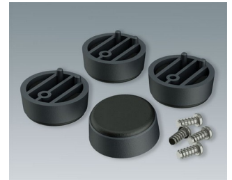
A9257404 Case feet, Vers. I ABS (UL 94 HB) anthracite grey RAL 7016 ø30x12mm