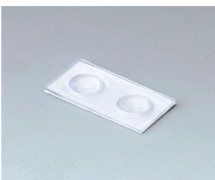
A9207150 Anti-slide feet 6.5 x 2 mm transparent