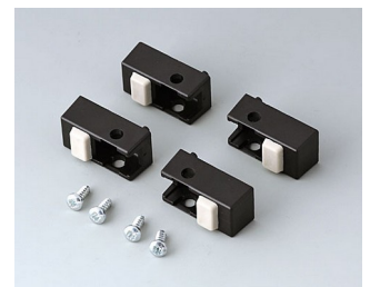
A9257109 Case feet, Vers. I ABS (UL 94 HB) black RAL 9005