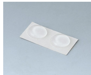
A9210180 Anti-slide feet 10,1 x 1.8 mm transparent