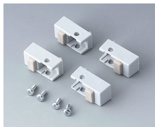
A9257105 Case feet, Vers. I ABS (UL 94 HB) light grey RAL 7035