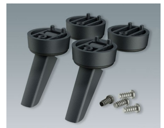
A9257504 Case feet, Vers. II ABS (UL 94 HB) anthracite grey RAL 7016 ø30x12mm