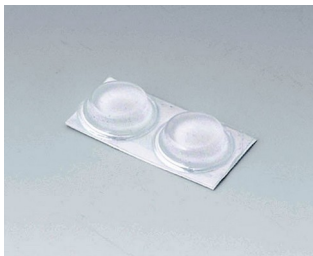
A9212330 Anti-slide feet 12 x 3.5 mm transparent