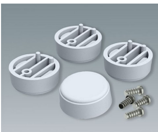
A9257405 Case feet, Vers. I ABS (UL 94 HB) light grey RAL 7035 ø30x12mm