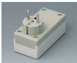
A9011665 PLUG CASE F / D, Vers. I PC+ABS (UL 94 V-0) off-white RAL 9002 100x50x40mm