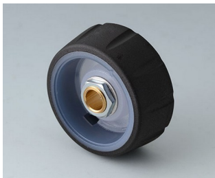
B7136631 CONTROL-KNOBS 36, optional illumination PC nero 36x14.7mm 1/4"