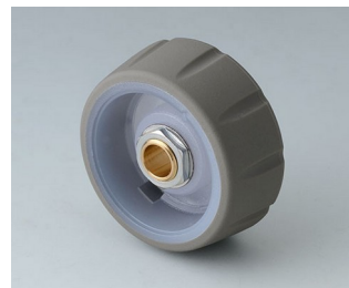
B7136063 CONTROL-KNOBS 36, optional illumination PC volcano 36x14.7mm 6mm