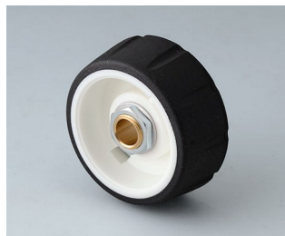
B7136062 CONTROL-KNOBS 36 PC nero 36x14.7mm 6mm