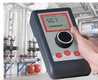
Find compressed air leaks using ultrasound