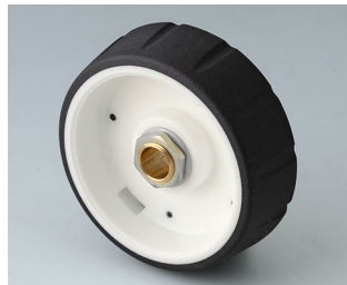
B7146632 CONTROL-KNOBS 46 PC nero 46x14.7mm 1/4"