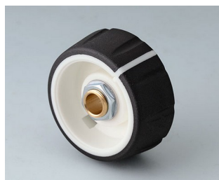
B7236632 CONTROL-KNOBS 36 PC nero 36x14.7mm 1/4"