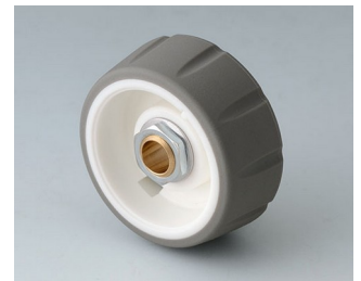
B7136634 CONTROL-KNOBS 36 PC volcano 36x14.7mm 1/4"