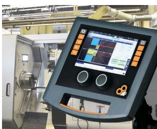
Operating elements for machine control