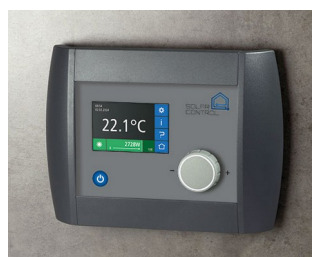
Solar Control Panel