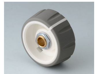
B7236064 CONTROL-KNOBS 36 PC volcano 36x14.7mm 6mm