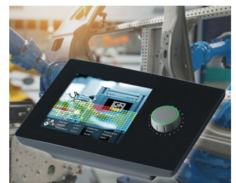
Measured value display device