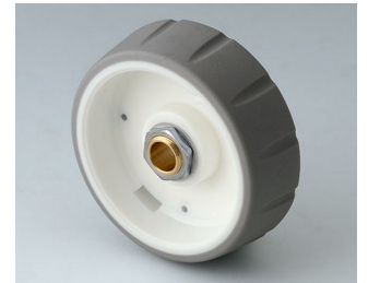
B7146064 CONTROL-KNOBS 46 PC volcano 46x14.7mm 6mm