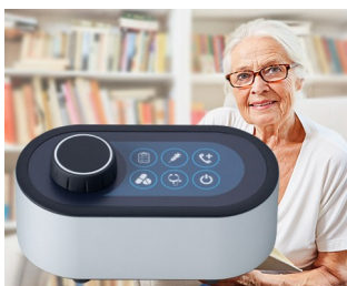
Assistance system for the home

For rotary potentiometers or rotary encoders with round shaft ends in accordance with DIN 41591, including touch function. Measuring and control technology, medical and laboratory equipment, wellness sector, health care, heating and air conditioning technology, communication devices, building control systems, smart Factory, etc.