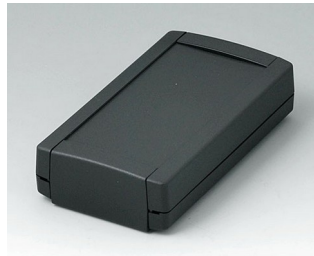
B1055369 TOPTEC 123 F, Vers. I ABS (UL 94 HB) black RAL 9005 123x68x30mm IP 40