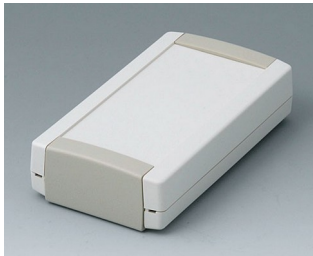
B1055365 TOPTEC 123 F, Vers. I ABS (UL 94 HB) off-white RAL 9002 123x68x30mm IP 40