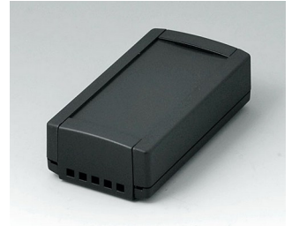
B1040469 TOPTEC 102, Vers. II ABS (UL 94 HB) black RAL 9005 102x54x30mm IP 40