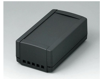
B1050469 TOPTEC 123 H, Vers. II ABS (UL 94 HB) black RAL 9005 123x68x45mm IP 40