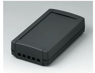
B1055469 TOPTEC 123 F, Vers. II ABS (UL 94 HB) black RAL 9005 123x68x30mm IP 40