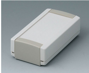
B1040365 TOPTEC 102, Vers. I ABS (UL 94 HB) off-white RAL 9002 102x54x30mm IP 40