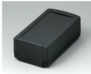
B1050369 TOPTEC 123 H, Vers. I ABS (UL 94 HB) black RAL 9005 123x68x45mm IP 40