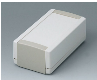
B1060365 TOPTEC 154 H, Vers. I ABS (UL 94 HB) off-white RAL 9002 154x84x56mm IP 40