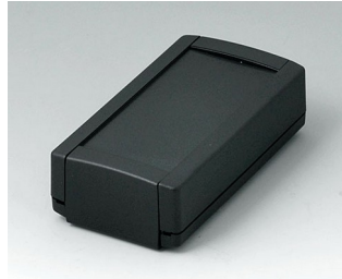
B1040369 TOPTEC 102, Vers. I ABS (UL 94 HB) black RAL 9005 102x54x30mm IP 40