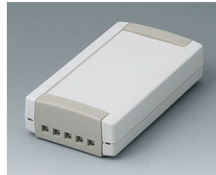
B1055465 TOPTEC 123 F, Vers. II ABS (UL 94 HB) off-white RAL 9002 123x68x30mm IP 40