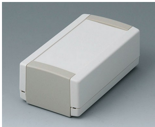
B1050365 TOPTEC 123 H, Vers. I ABS (UL 94 HB) off-white RAL 9002 123x68x45mm IP 40