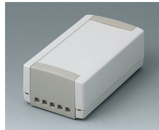
B1050465 TOPTEC 123 H, Vers. II ABS (UL 94 HB) off-white RAL 9002 123x68x45mm IP 40