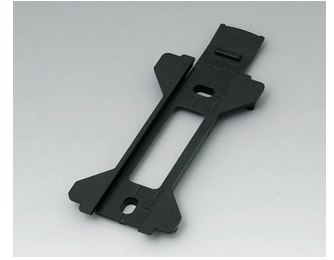
B1360029 Wall suspension element for Toptec 154 ABS (UL 94 HB) black RAL 9005