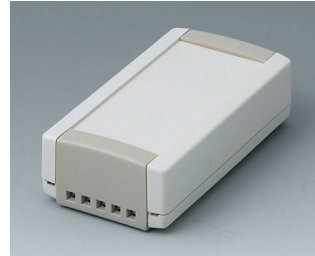
B1040465 TOPTEC 102, Vers. II ABS (UL 94 HB) off-white RAL 9002 102x54x30mm IP 40