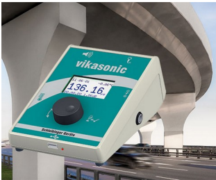
Ultrasonic measuring device