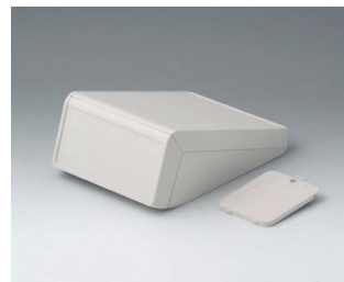
B4054227 UNITEC S, 1.4/0.6 ABS (UL 94 HB) off-white RAL 9002 125x177x69mm IP 40