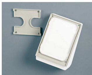
B4154307 Wall suspension element S off-white RAL 9002