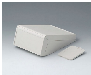
B4054217 UNITEC S, 1.4/1.4 ABS (UL 94 HB) off-white RAL 9002 125x177x69mm IP 40