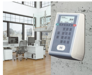
Time recording terminal