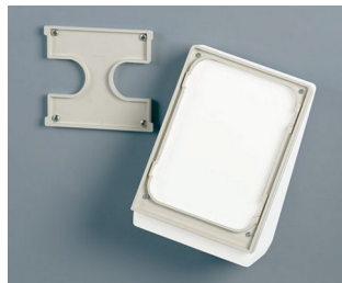
B4156307 Wall suspension element M off-white RAL 9002