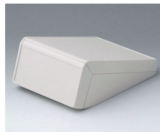
B4056127 UNITEC M, 1.4/0.6 ABS (UL 94 HB) off-white RAL 9002 148x210x80mm IP 40