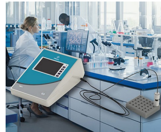
Measuring device for a research laboratory