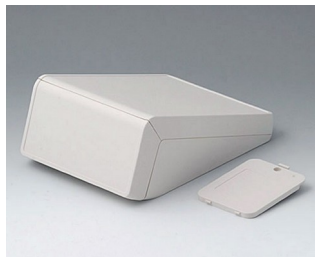
B4056207 UNITEC M, 0.6/0.6 ABS (UL 94 HB) off-white RAL 9002 148x210x80mm IP 40