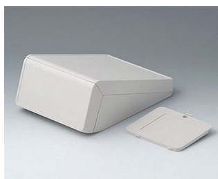
B4056307 UNITEC M, 0.6/0.6 ABS (UL 94 HB) off-white RAL 9002 148x210x80mm IP 40