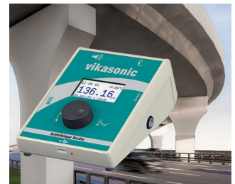
Ultrasonic measuring device