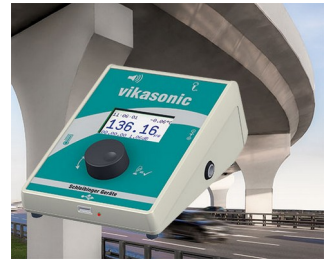
Ultrasonic measuring device