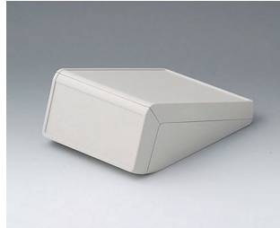
B4054117 UNITEC S, 1.4/1.4 ABS (UL 94 HB) off-white RAL 9002 125x177x69mm IP 40