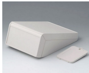
B4056227 UNITEC M, 1.4/0.6 ABS (UL 94 HB) off-white RAL 9002 148x210x80mm IP 40