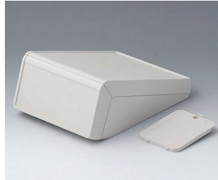
B4056217 UNITEC M, 1.4/1.4 ABS (UL 94 HB) off-white RAL 9002 148x210x80mm IP 40