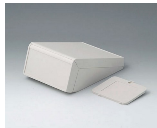
B4054327 UNITEC S, 1.4/0.6 ABS (UL 94 HB) off-white RAL 9002 125x177x69mm IP 40