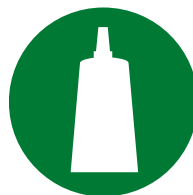
Installation / Assembly of accessories