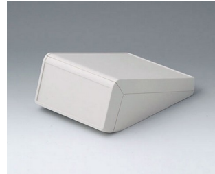
B4054127 UNITEC S, 1.4/0.6 ABS (UL 94 HB) off-white RAL 9002 125x177x69mm IP 40