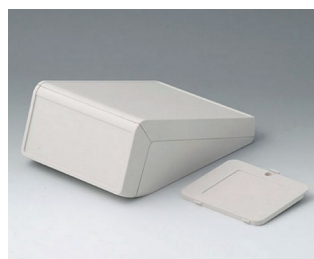
B4056327 UNITEC M, 1.4/0.6 ABS (UL 94 HB) off-white RAL 9002 148x210x80mm IP 40