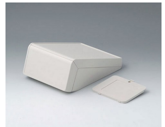
B4054337 UNITEC S, 0.6/1.4 ABS (UL 94 HB) off-white RAL 9002 125x177x69mm IP 40