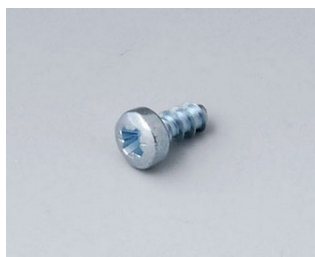
A0306031 Self-tapping screws 3 x 6 mm (PZ1)