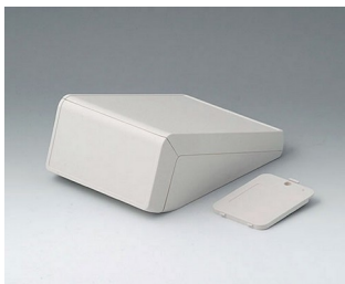
B4054207 UNITEC S, 0.6/0.6 ABS (UL 94 HB) off-white RAL 9002 125x177x69mm IP 40