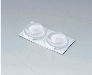
A9212330 Anti-slide feet 12 x 3.5 mm transparent

Subject to technical modification without notice. © by OKW Gehäusesysteme, Buchen/Germany.