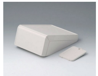
B4054237 UNITEC S, 0.6/1.4 ABS (UL 94 HB) off-white RAL 9002 125x177x69mm IP 40