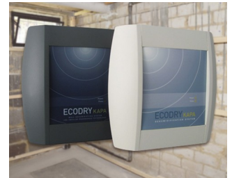
Systems for drying brickwork