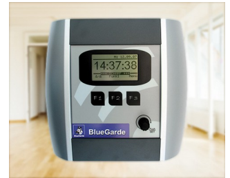
House control unit