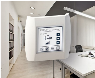
Indoor air quality control