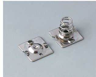
A9190015 Set of battery clips, 2 x AA Steel nickel-plated