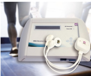
WBA receiver unit for measuring biosignals