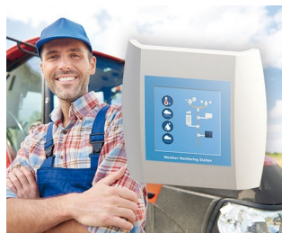
Weather Monitoring Station