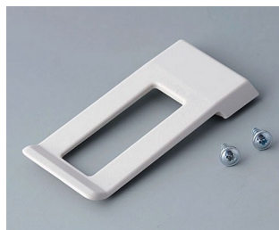
A9172107 Belt/Pocket clip ABS (UL 94 HB) off-white RAL 9002 62x30mm