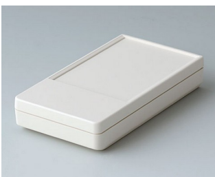
A9070107 DATEC-POCKET-BOX S ABS (UL 94 HB) off-white RAL 9002 85x46x16mm IP 41