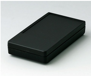
A9070209 DATEC-POCKET-BOX S PMMA (IR) (UL 94 HB) black RAL 9005 85x46x16mm IP 41