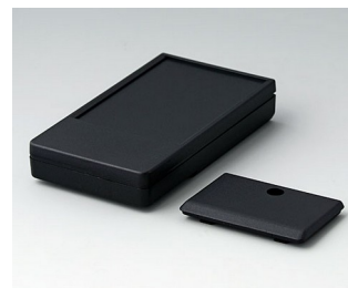
A9071209 DATEC-POCKET-BOX M PMMA (IR) (UL 94 HB) black RAL 9005 105x58x18.5mm IP 41