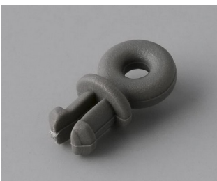
A9100001 Ring eyelet PA 6 volcano