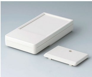
A9072107 DATEC-POCKET-BOX L ABS (UL 94 HB) off-white RAL 9002 120x65x22mm IP 41