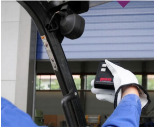
IR remote control for harsh environments

Especially suitable for measuring and control technology, remote controls, pulse generator for ultra-sound and infra-red, sensors, optoelectronics, mobile data recording, wireless communications, etc.