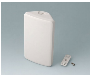
B4608107 SMART-CONTROL S, Vers. I ASA+PC-FR (UL 94 V-0) off-white RAL 9002 142x81x46mm IP 55 opt., IP 40