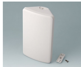
B4610107 SMART-CONTROL M, Vers. I ASA+PC-FR (UL 94 V-0) off-white RAL 9002 173x101x59mm IP 55 opt., IP 40