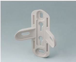
B4705907 Wall suspension element ASA+PC-FR (UL 94 V-0)