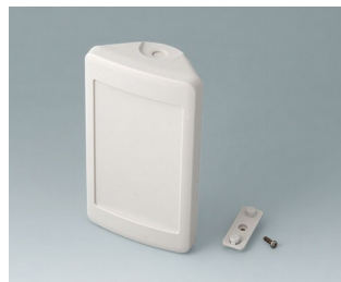
B4608207 SMART-CONTROL S, Vers. II ASA+PC-FR (UL 94 V-0) off-white RAL 9002 142x81x46mm IP 55 opt., IP 40