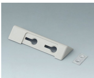
B4705207 Desktop stand set ASA+PC-FR (UL 94 V-0)