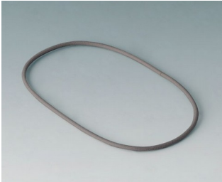
B4708920 Seal S