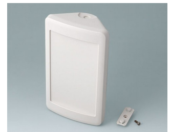
B4610207 SMART-CONTROL M, Vers. II ASA+PC-FR (UL 94 V-0) off-white RAL 9002 173x101x59mm IP 55 opt., IP 40