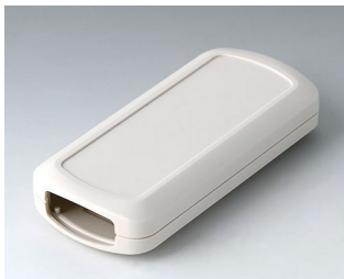
B2833107 CONNECT M ASA+PC (UL 94 V-0) off-white RAL 9002 116x54x22mm