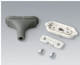
B2911318 Cable gland kit, 4.2 - 5.0 TPE volcano