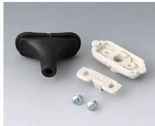
B2911319 Cable gland kit, 4.2 - 5.0 TPE black RAL 9005