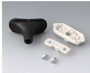
B2911319 Cable gland kit, 4.2 - 5.0 TPE black RAL 9005