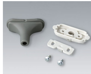
B2911328 Cable gland kit, 5.0 - 5.9 TPE volcano