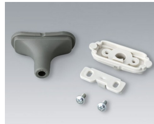
B2911328 Cable gland kit, 5.0 - 5.9 TPE volcano