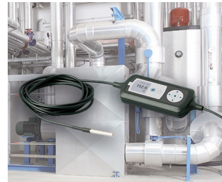
Process monitoring with temperature sensor