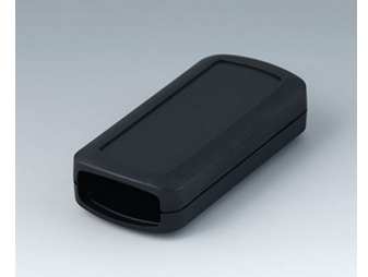
B2823109 CONNECT S ASA+PC (UL 94 V-0) black RAL 9005 90x42x22mm