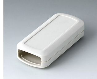
B2823107 CONNECT S ASA+PC (UL 94 V-0) off-white RAL 9002 90x42x22mm