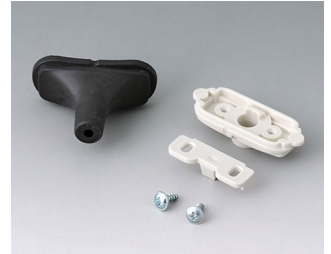
B2911309 Cable gland kit, 3.4 - 4.2 TPE black RAL 9005