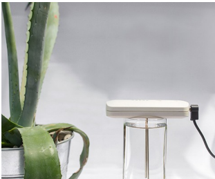
Tool for making colloidal silver solutions