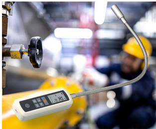
Gas leak detector

Data systems engineering, network technology, building services systems, safety engineering, IoT/ IIoT, medical and therapeutic applications, analytical instruments in the laboratory, measuring technology, including detectors with measuring sensors, test systems/instruments, data loggers in environmental technology, sensor systems, etc.