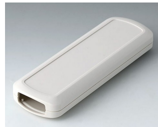
B2834107 CONNECT M ASA+PC (UL 94 V-0) off-white RAL 9002 156x54x22mm