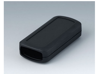
B2823109 CONNECT S ASA+PC (UL 94 V-0) black RAL 9005 90x42x22mm