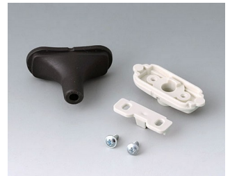
B2911329 Cable gland kit, 5.0 - 5.9 TPE black RAL 9005