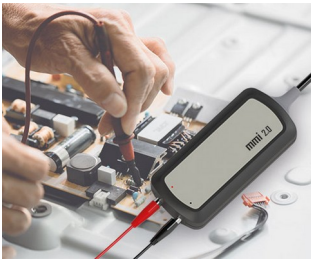
Test probe interface for PC applications