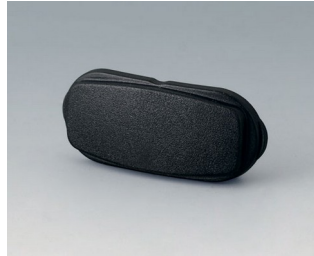
B2811209 End part ASA+PC (UL 94 V-0) black RAL 9005