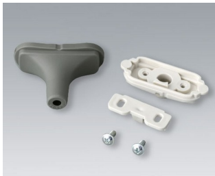
B2911318 Cable gland kit, 4.2 - 5.0 TPE volcano