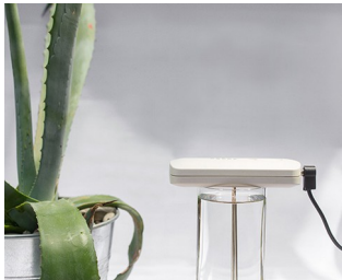
Tool for making colloidal silver solutions