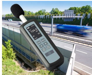
Noise level measurement