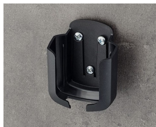
B2931509 Holder M ASA+PC (UL 94 V-0) black RAL 9005