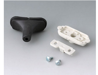
B2911309 Cable gland kit, 3.4 - 4.2 TPE black RAL 9005