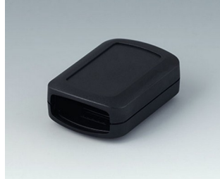
B2822109 CONNECT S ASA+PC (UL 94 V-0) black RAL 9005 60x42x22mm