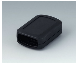
B2822109 CONNECT S ASA+PC (UL 94 V-0) black RAL 9005 60x42x22mm