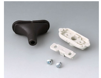
B2911329 Cable gland kit, 5.0 - 5.9 TPE black RAL 9005