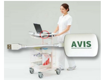
Receiver and data transfer for EMR