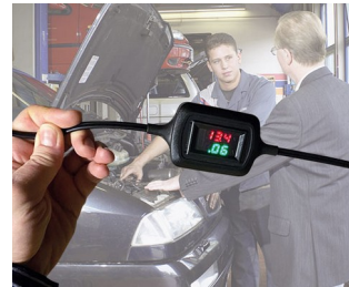
Voltage and current display during trickle charging