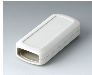
B2823107 CONNECT S ASA+PC (UL 94 V-0) off-white RAL 9002 90x42x22mm