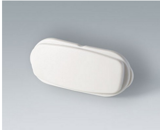
B2811207 End part ASA+PC (UL 94 V-0) off-white RAL 9002