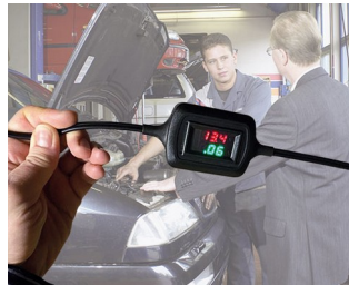
Voltage and current display during trickle charging