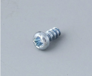
A0304031 Self-tapping screws 2.2 x 5 mm (PZ1)

Subject to technical modification without notice. © by OKW Gehäusesysteme, Buchen/Germany.