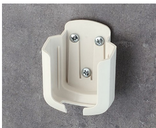
B2931507 Holder M ASA+PC (UL 94 V-0) off-white RAL 9002