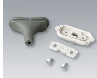
B2911308 Cable gland kit, 3.4 - 4.2 TPE volcano