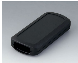
B2833109 CONNECT M ASA+PC (UL 94 V-0) black RAL 9005 116x54x22mm