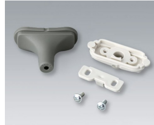
B2911308 Cable gland kit, 3.4 - 4.2 TPE volcano