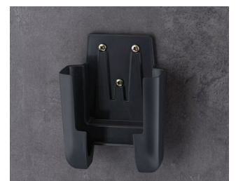
A9106628 Holder M ASA+PC (UL 94 V-0) lava