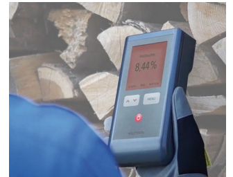
Wood moisture measuring device