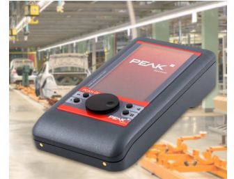
Mobile diagnostic device for CAN and CAN FD buses