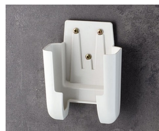
A9106627 Holder M ASA+PC (UL 94 V-0) off-white RAL 9002