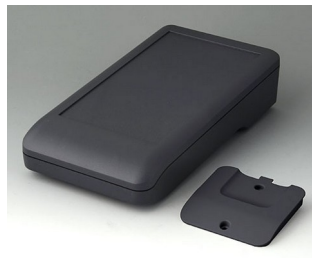
A9007208 DATEC-COMPACT L ASA+PC (UL 94 V-0) lava 206x110x47mm IP 65