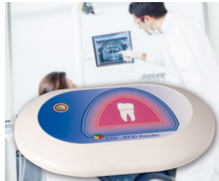
RFID Reader for the CTV system