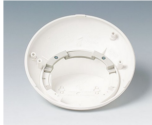
B5111707 Anti-rotation device ABS (UL 94 HB) off-white RAL 9002