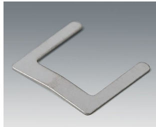
A9166002 Battery contact, 2 x AAA Steel tin-plated