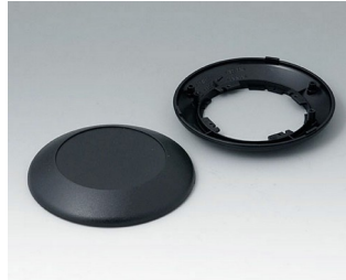
B5010009 Bottom and top part R110 F ABS (UL 94 HB) black RAL 9005 ø110x30mm