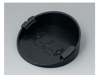
B5011219 Base 30° ABS (UL 94 HB) black RAL 9005