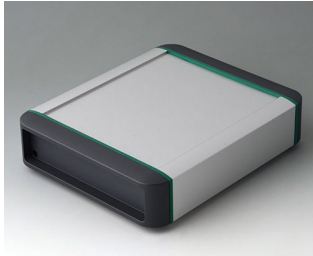
B3407011 SMART-TERMINAL 160 Aluminium AIMgSi 0.5 matt anodised 202x170x50mm IP 54