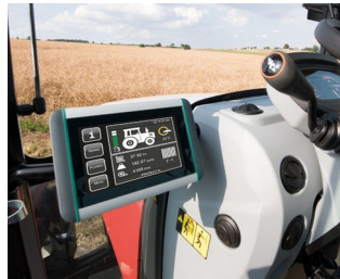
ISOBUS terminal for tractors and self-propelled machines