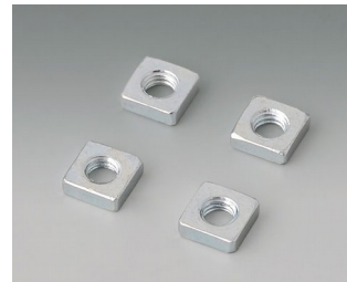
B3500001 Set of M3 square-head nuts Steel