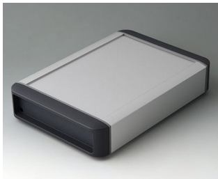
B3407022 SMART-TERMINAL 200 Aluminium AIMgSi 0.5 matt anodised 242x170x50mm IP 54