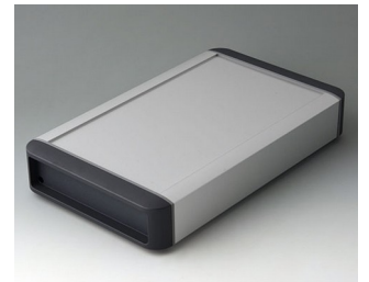
B3407032 SMART-TERMINAL 240 Aluminium AIMgSi 0.5 matt anodised 282x170x50mm IP 54