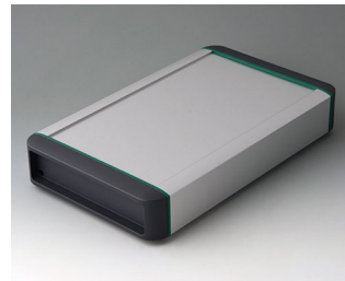
B3407031 SMART-TERMINAL 240 Aluminium AIMgSi 0.5 matt anodised 282x170x50mm IP 54