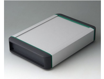
B3407021 SMART-TERMINAL 200 Aluminium AIMgSi 0.5 matt anodised 242x170x50mm IP 54