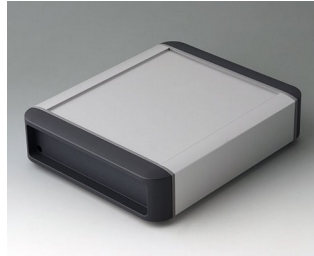
B3407012 SMART-TERMINAL 160 Aluminium AIMgSi 0.5 matt anodised 202x170x50mm IP 54