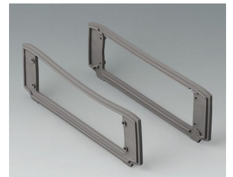
B3507017 Designer seals set, volcano TPV 50A volcano