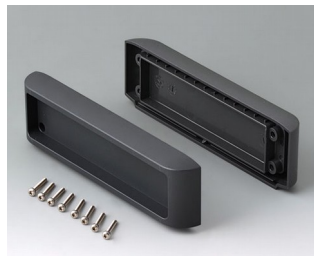
B3507011 Side covers set ASA+PC-FR (UL 94 V-0) lava