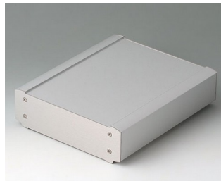
B3407023 SMART-TERMINAL 200 Aluminium AIMgSi 0.5 matt anodised 204x170x50mm