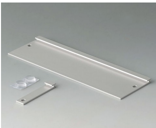
B3507020 Wall suspension element Aluminium