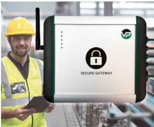
Industrial Secure Gateway