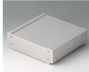
B3407013 SMART-TERMINAL 160 Aluminium AIMgSi 0.5 matt anodised 164x170x50mm