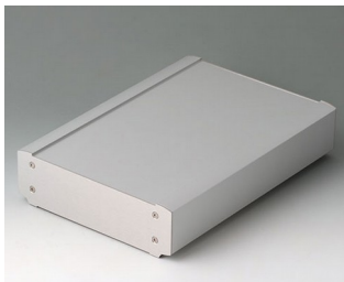
B3407033 SMART-TERMINAL 240 Aluminium AIMgSi 0.5 matt anodised 244x170x50mm