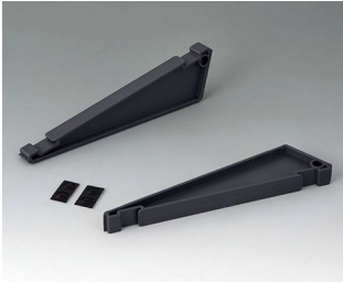
B3507030 Case canting kit ASA+PC-FR (UL 94 V-0) lava