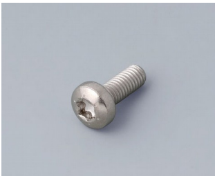
A0330080 Screw M3 x 8 mm (T10) Stainless steel