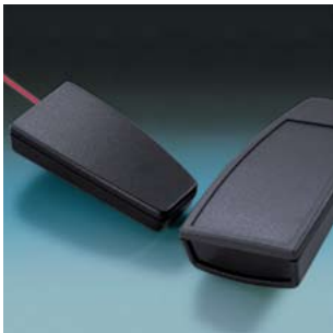
Off-white, RAL 9002 Black, RAL 9005

(cutouts of pillars and battery compartment not taken into consideration)