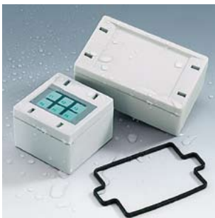
Light gray, RAL 7035