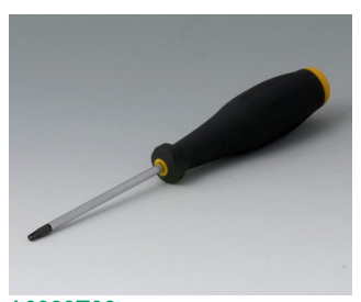
A0399T08 Torx T8 screwdriver

Subject to technical modification without notice. © by OKW Gehäusesysteme, Buchen/Germany.