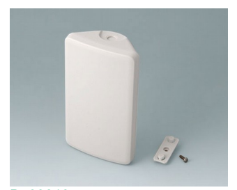
B4608107 SMART-CONTROL S, Vers. I ASA+PC (UL 94 V-0) off-white RAL 9002 142x81x46mm IP 55 opt., IP 40