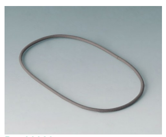
B4708920 Seal S