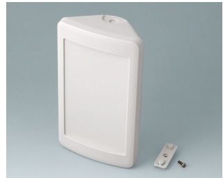
B4610207 SMART-CONTROL M, Vers. II ASA+PC (UL 94 V-0) off-white RAL 9002 173x101x59mm IP 55 opt., IP 40