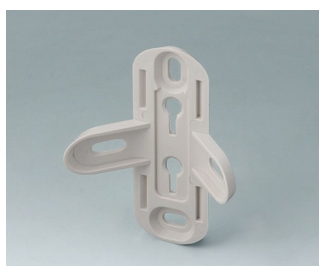
B4705907 Wall suspension element ASA+PC (UL 94 V-0)