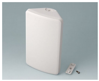
B4610107 SMART-CONTROL M, Vers. I ASA+PC (UL 94 V-0) off-white RAL 9002 173x101x59mm IP 55 opt., IP 40