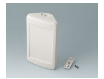
B4608207 SMART-CONTROL S, Vers. II ASA+PC (UL 94 V-0) off-white RAL 9002 142x81x46mm IP 55 opt., IP 40