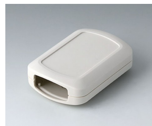
B2832107 CONNECT M ASA+PC (UL 94 V-0) off-white RAL 9002 76x54x22mm