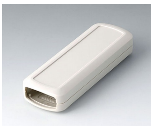
B2824107 CONNECT S ASA+PC (UL 94 V-0) off-white RAL 9002 120x42x22mm