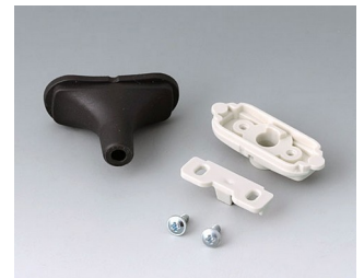
B2911329 Cable gland kit, 5.0 - 5.9 TPE black RAL 9005