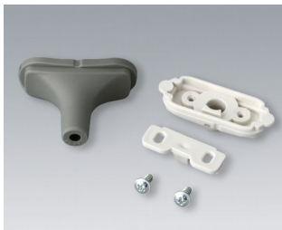
B2911318 Cable gland kit, 4.2 - 5.0 TPE volcano