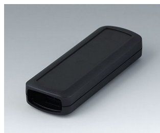
B2824109 CONNECT S ASA+PC (UL 94 V-0) black RAL 9005 120x42x22mm