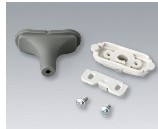
B2911308 Cable gland kit, 3.4 - 4.2 TPE volcano