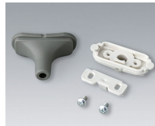
B2911328 Cable gland kit, 5.0 - 5.9 TPE volcano