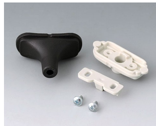
B2911319 Cable gland kit, 4.2 - 5.0 TPE black RAL 9005