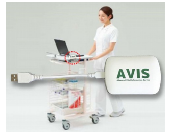
Receiver and data transfer for EMR