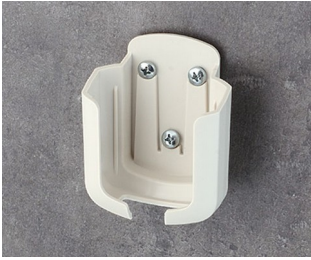
B2931507 Holder M ASA+PC (UL 94 V-0) off-white RAL 9002