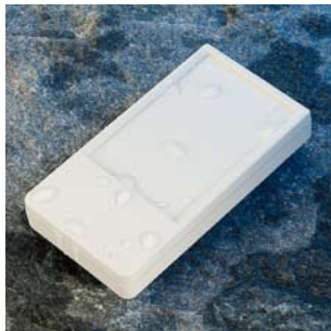
Off-white, RAL 9002 Black, RAL 9005

(cutouts of pillars not taken into consideration)