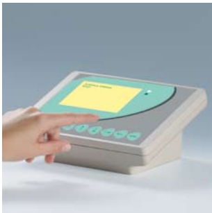
Off-white, RAL 9002